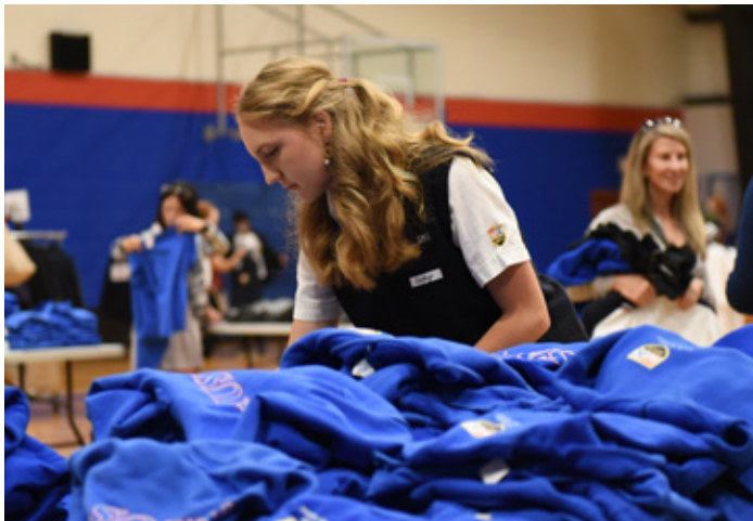
Used uniform sales are a substantial source of revenue for the PA.

Thank you to everyone who contributed their time and energy to the Parents' Auxiliary this past year. We look forward to another exciting year of supporting the school and our students in 2024-25.