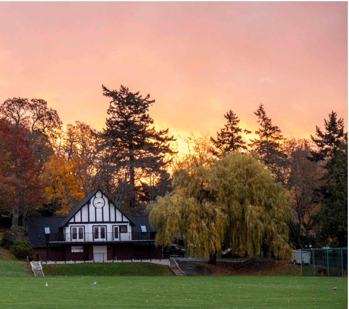
Sunrise colours over Reynolds House and the Wenman Pavilion.