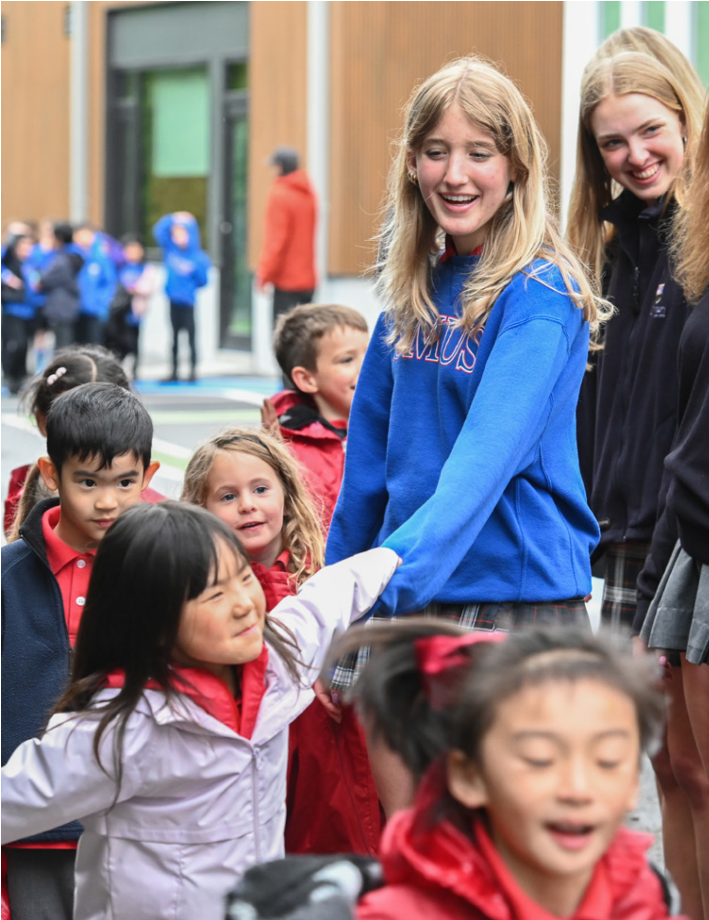
Lifers play with Kindergarten students during recess at Junior School.