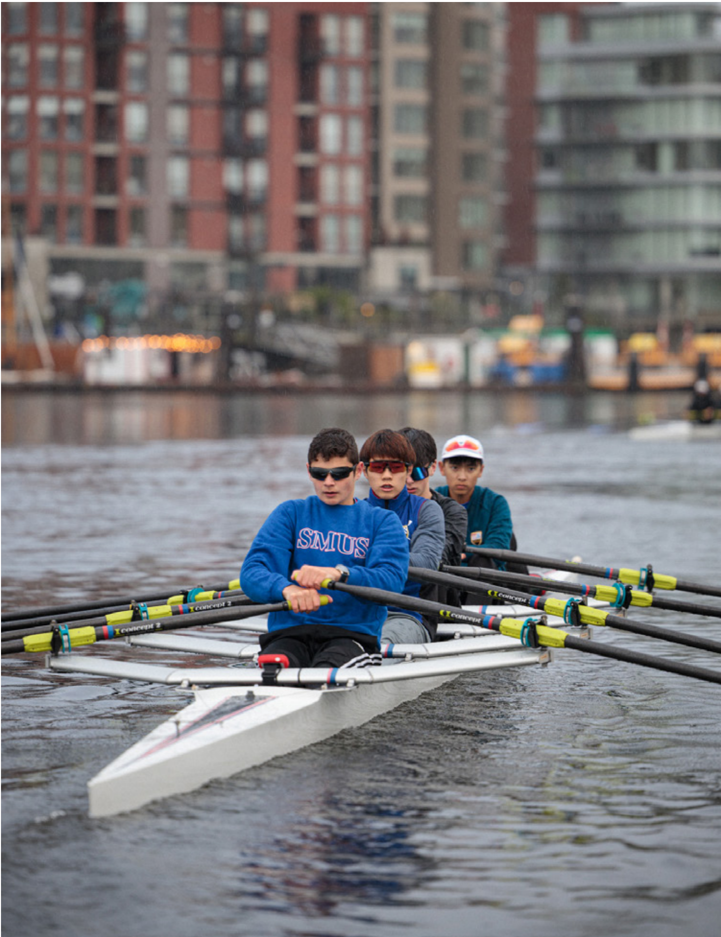
Rowing practice on the Gorge.