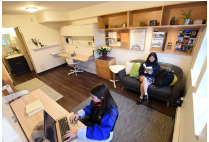
Recently renovated boarding room.

The renovations of the entranceway, common rooms, and houseparent offices were all successfully completed, along with pilot student bedrooms in Barnacle House.