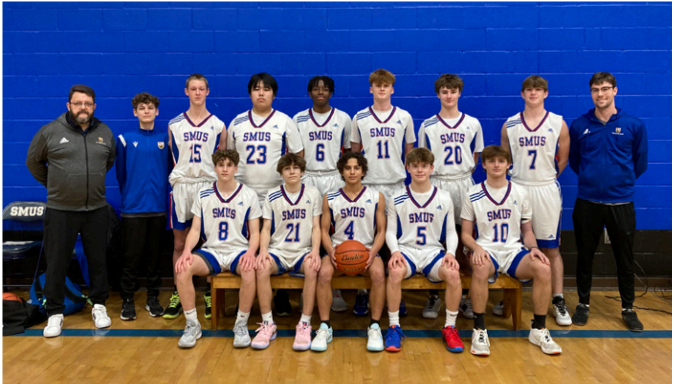
JUNIOR BOYS BASKETBALL TEAM