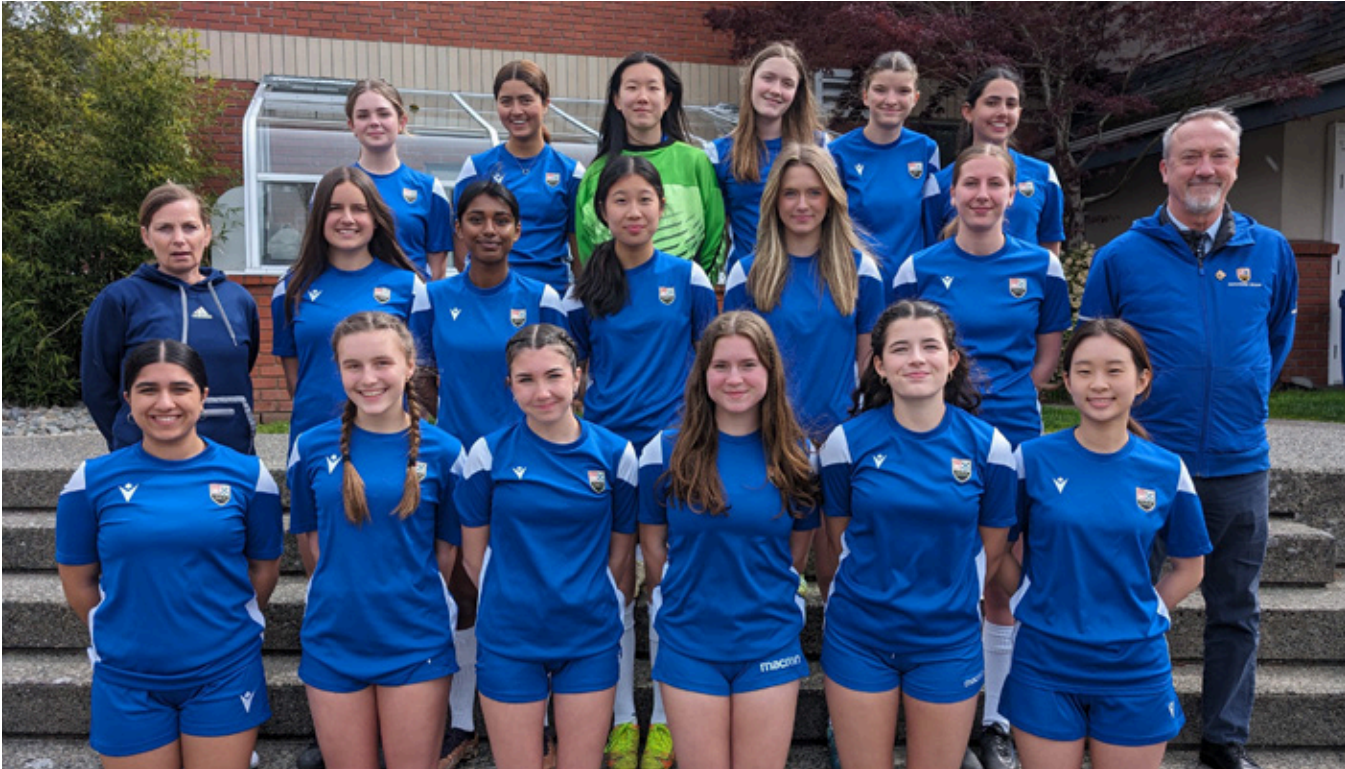
JUNIOR GIRLS SOCCER TEAM