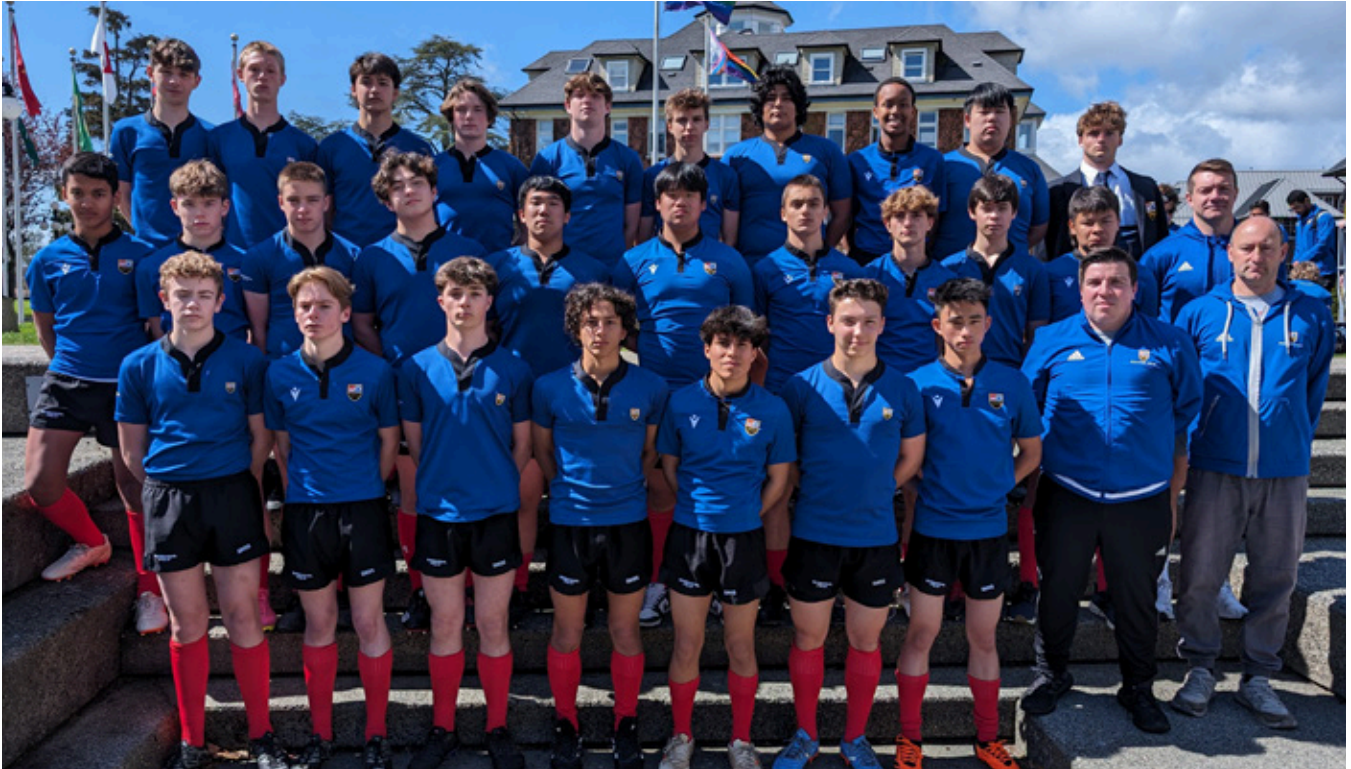
JUNIOR BOYS RUGBY TEAM