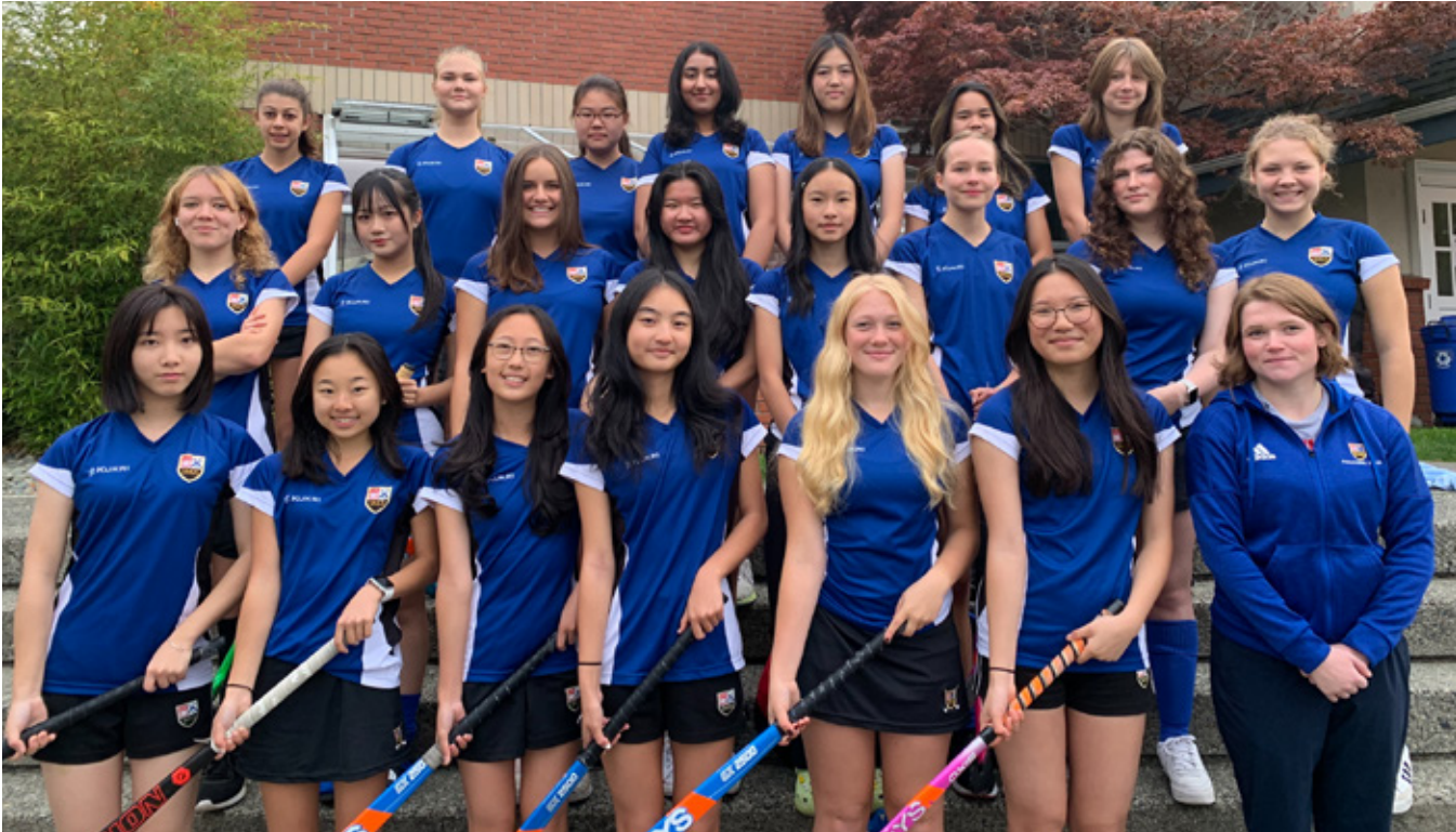
DEVELOPMENT FIELD HOCKEY TEAM