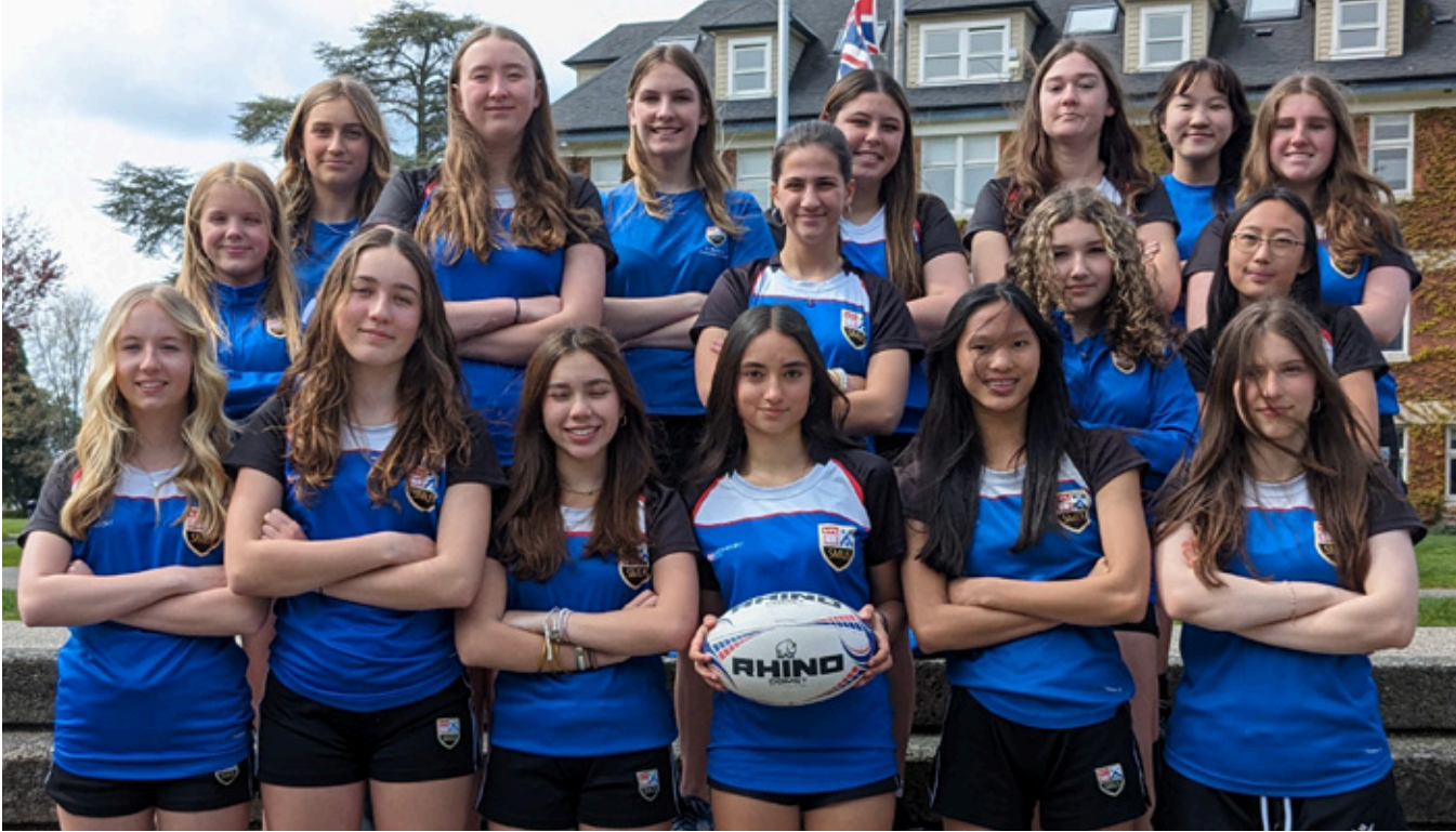
DEVELOPMENT GIRLS RUGBY