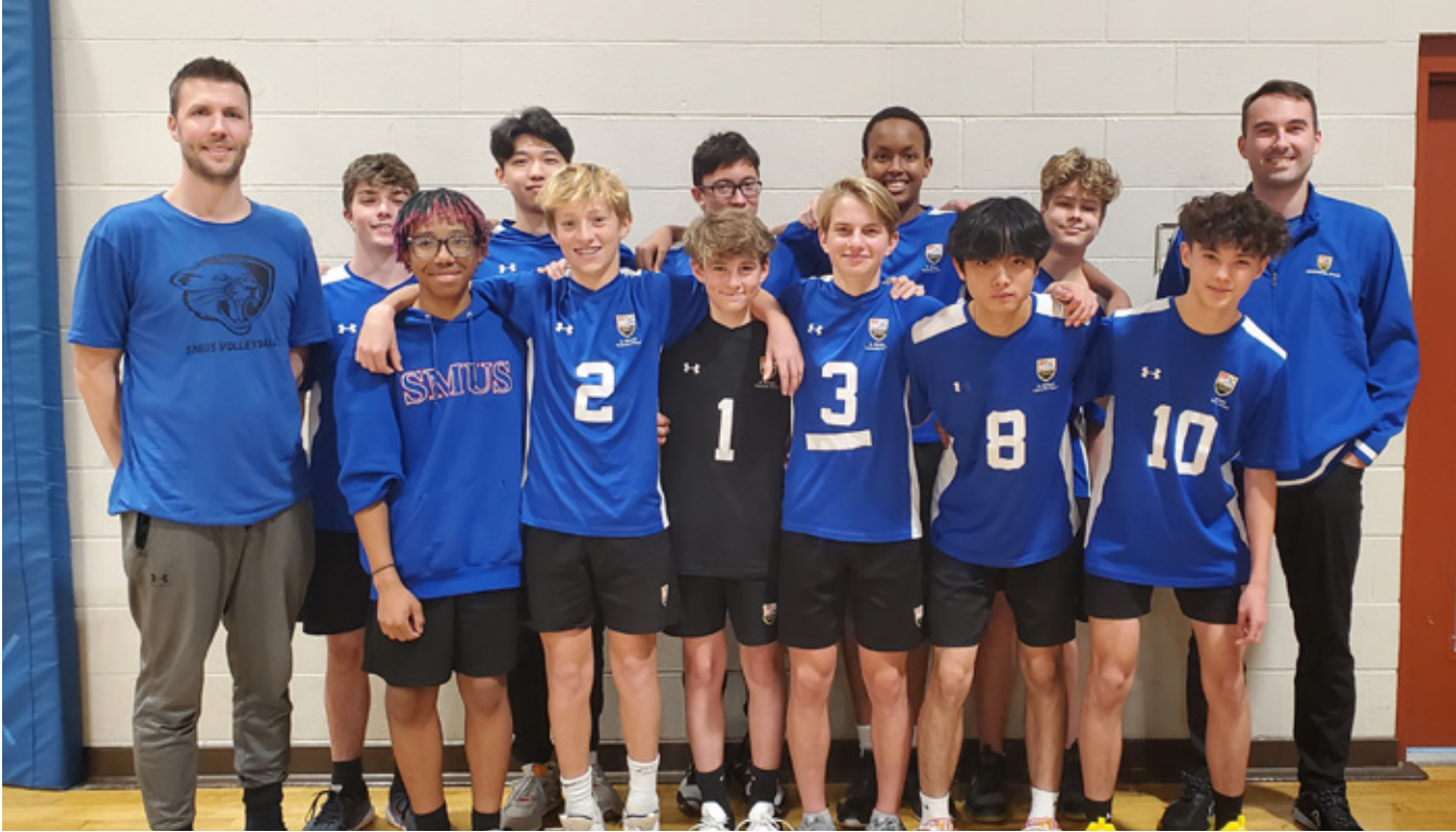
JUNIOR BOYS VOLLEYBALL TEAM