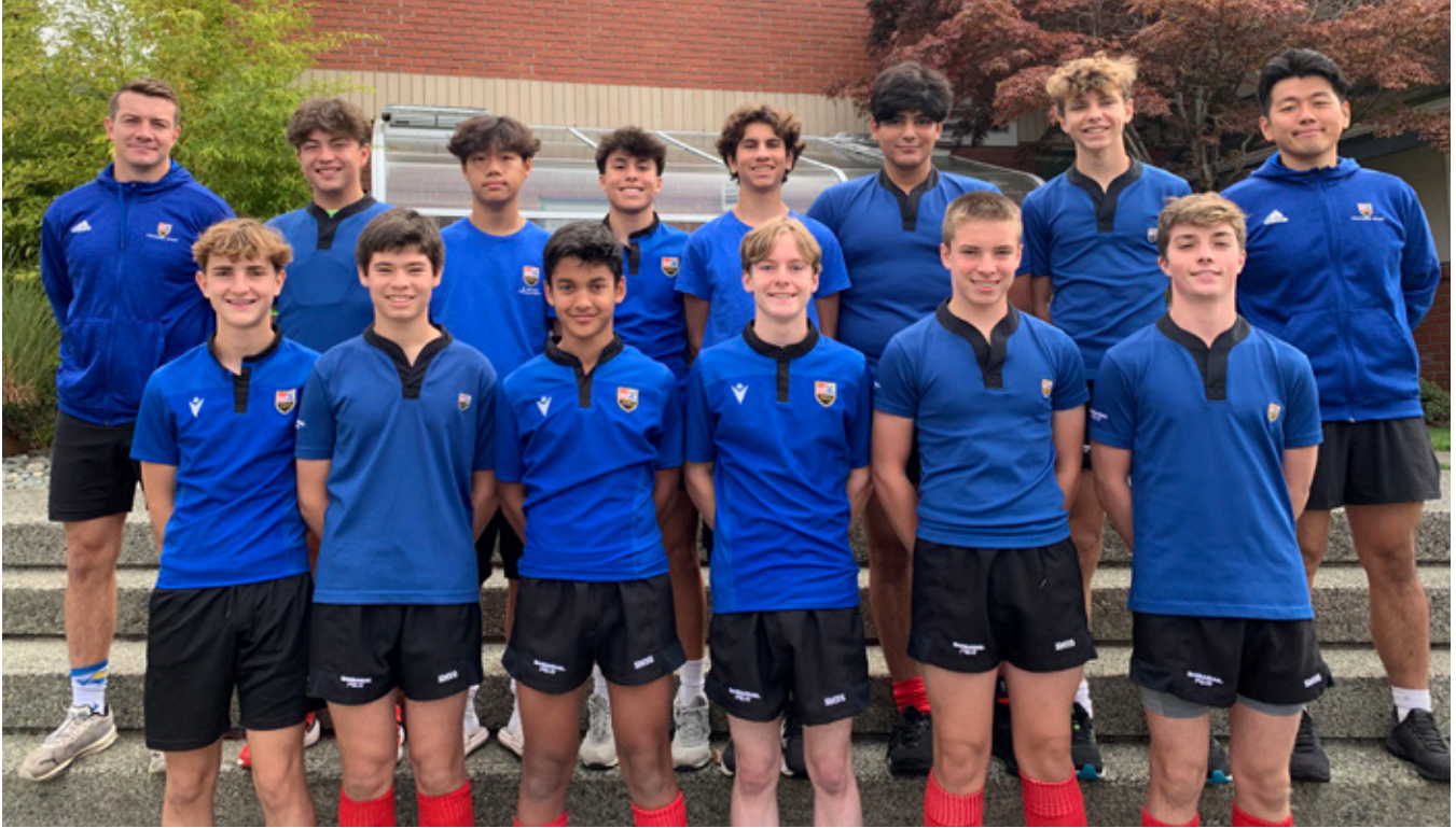
GRADE 9 BOYS RUGBY TEAM