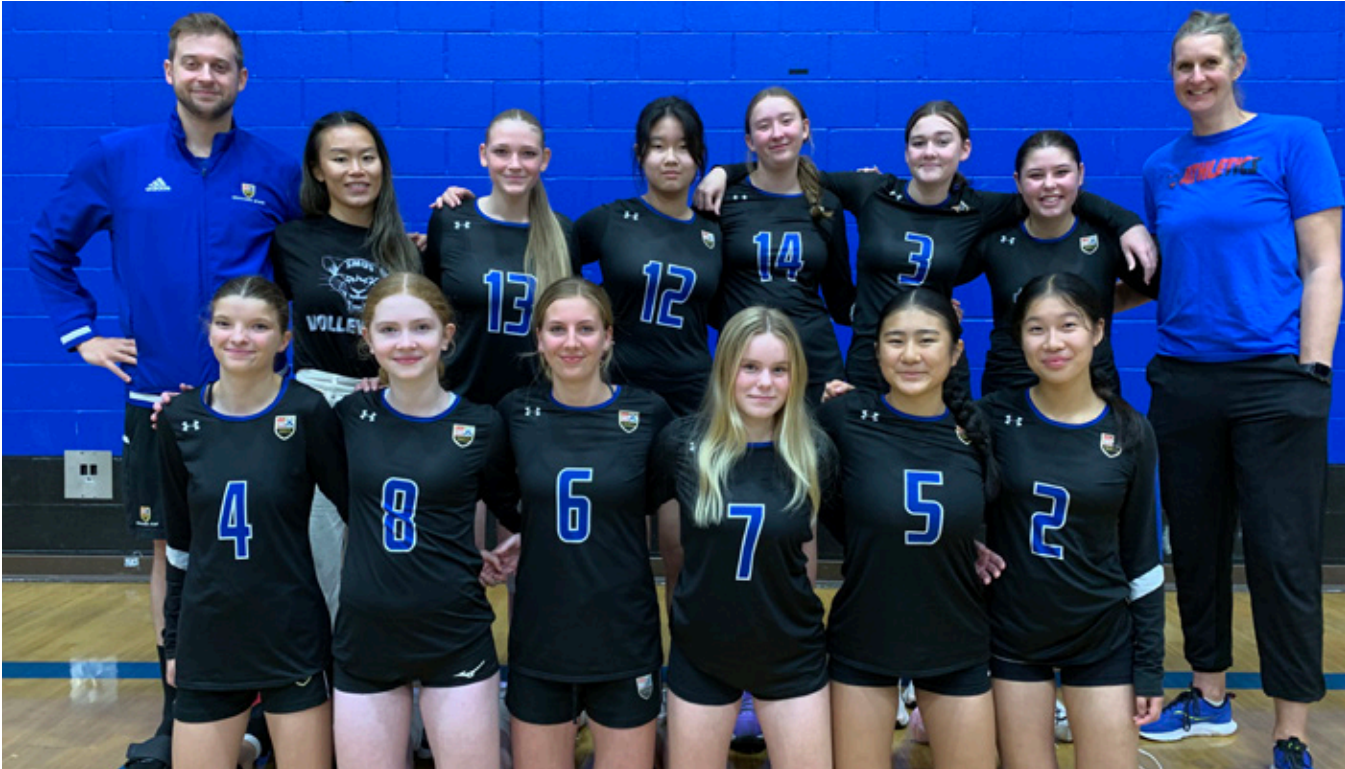
JUNIOR GIRLS VOLLEYBALL TEAM