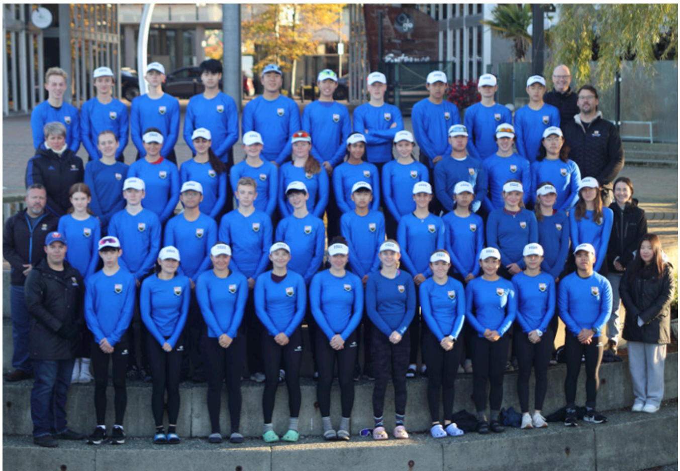
FALL ROWING TEAM