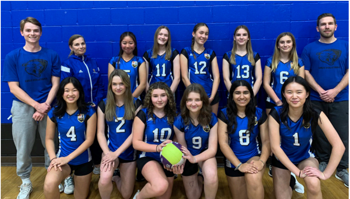
DEVELOPMENT JUNIOR GIRLS VOLLEYBALL TEAM