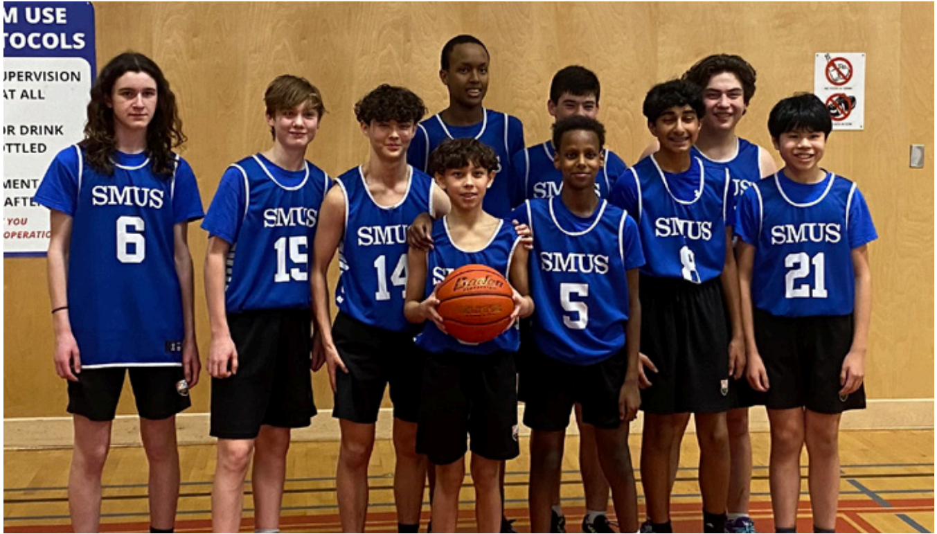
GRADE 9 BOYS BASKETBALL TEAM