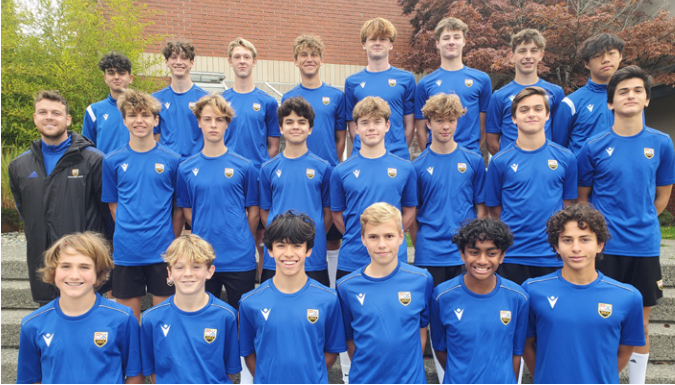
JUNIOR BOYS SOCCER TEAM