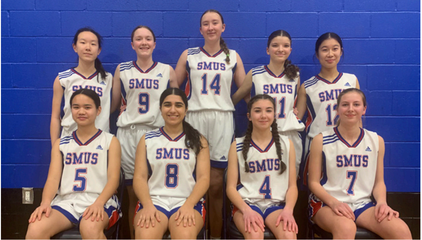
JUNIOR GIRLS BASKETBALL TEAM