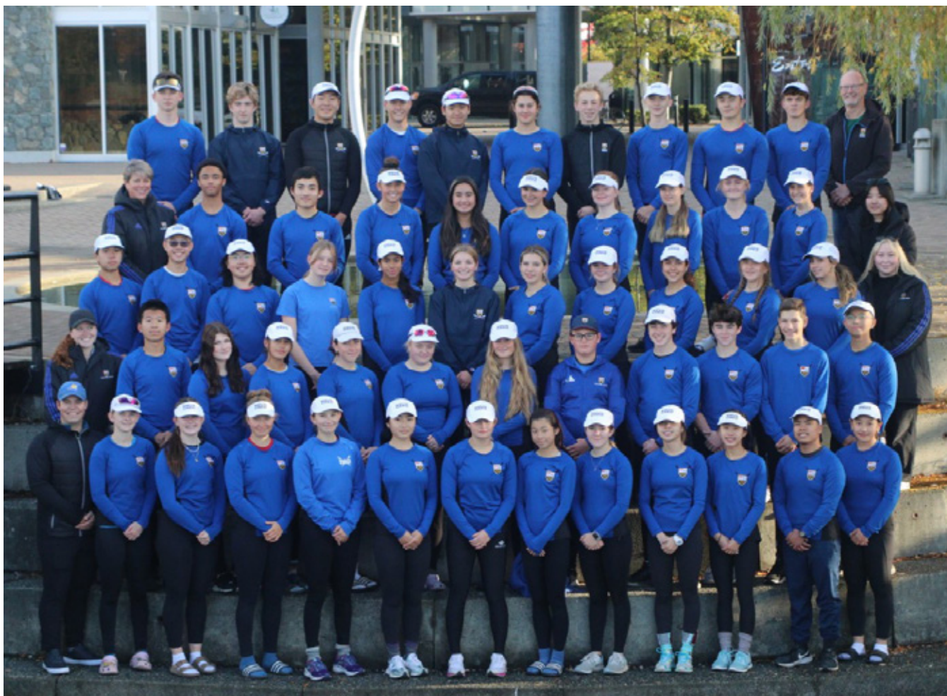
FALL ROWING TEAM