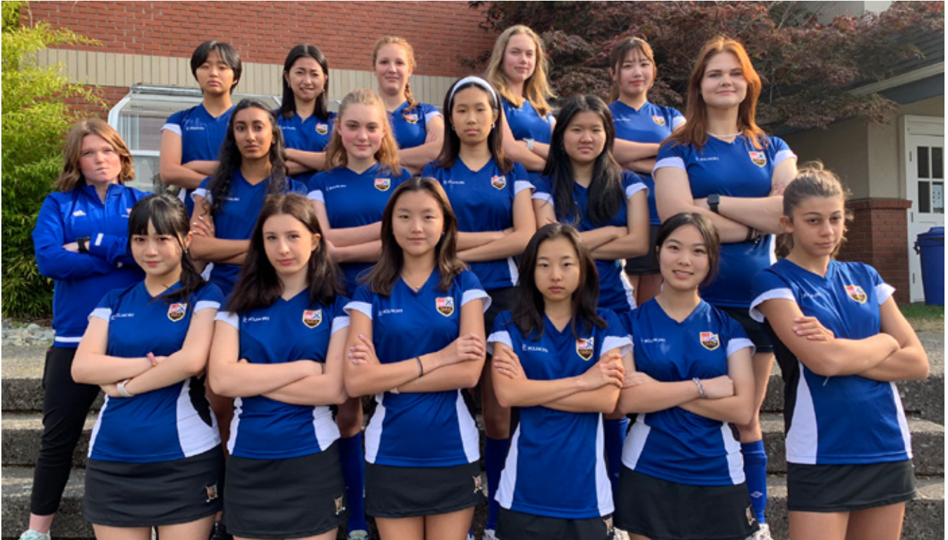
DEVELOPMENT FIELD HOCKEY TEAM