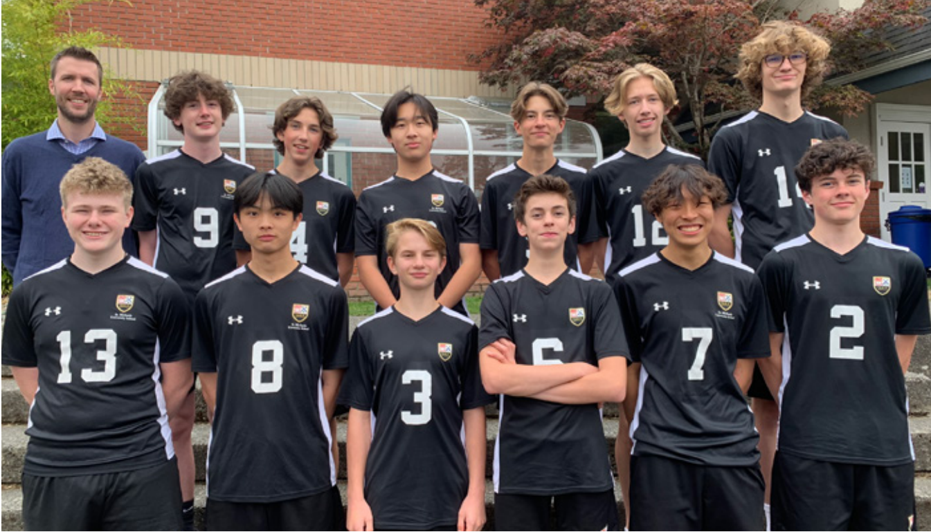
JUNIOR BOYS VOLLEYBALL TEAM