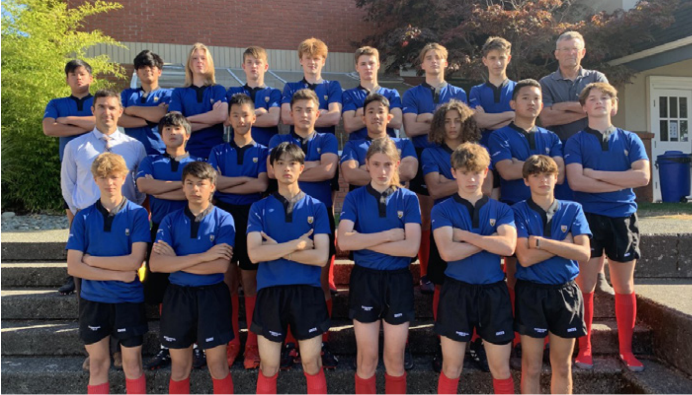
GRADE 9 BOYS RUGBY TEAM