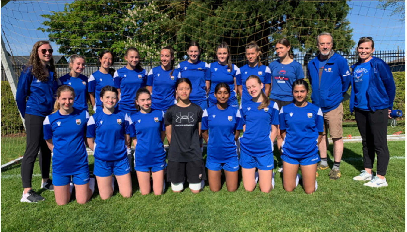
JUNIOR GIRLS SOCCER TEAM