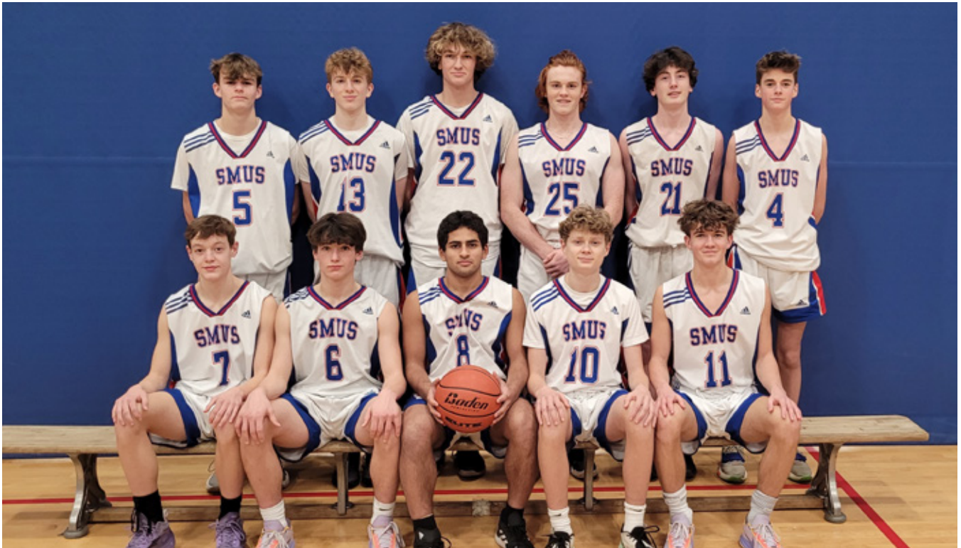
JUNIOR BOYS BASKETBALL TEAM