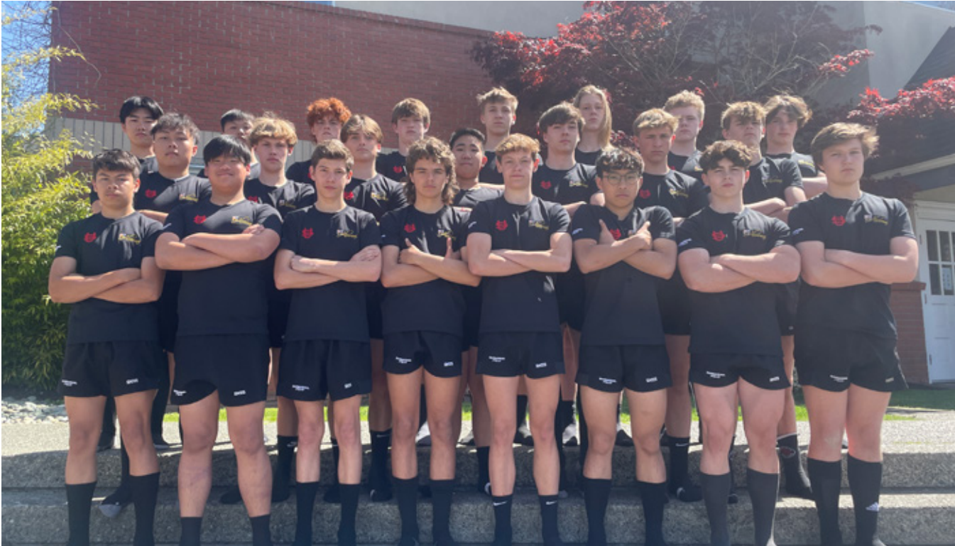
JUNIOR BOYS RUGBY TEAM