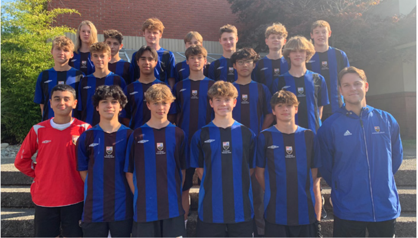
JUNIOR BOYS SOCCER TEAM