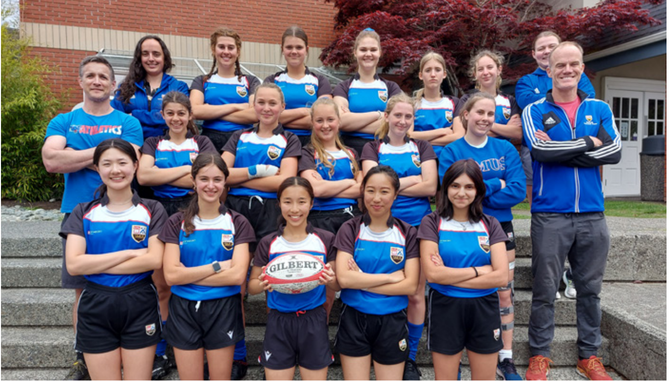
DEVELOPMENT GIRLS RUGBY