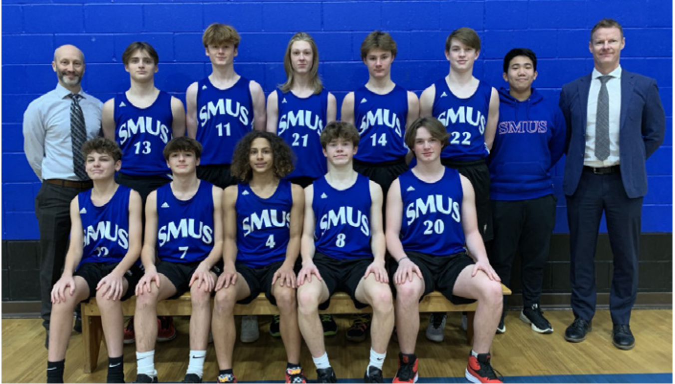
GRADE 9 BOYS BASKETBALL TEAM