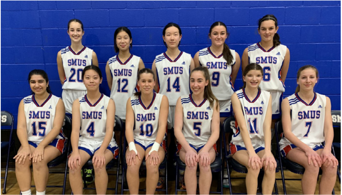
JUNIOR GIRLS BASKETBALL TEAM