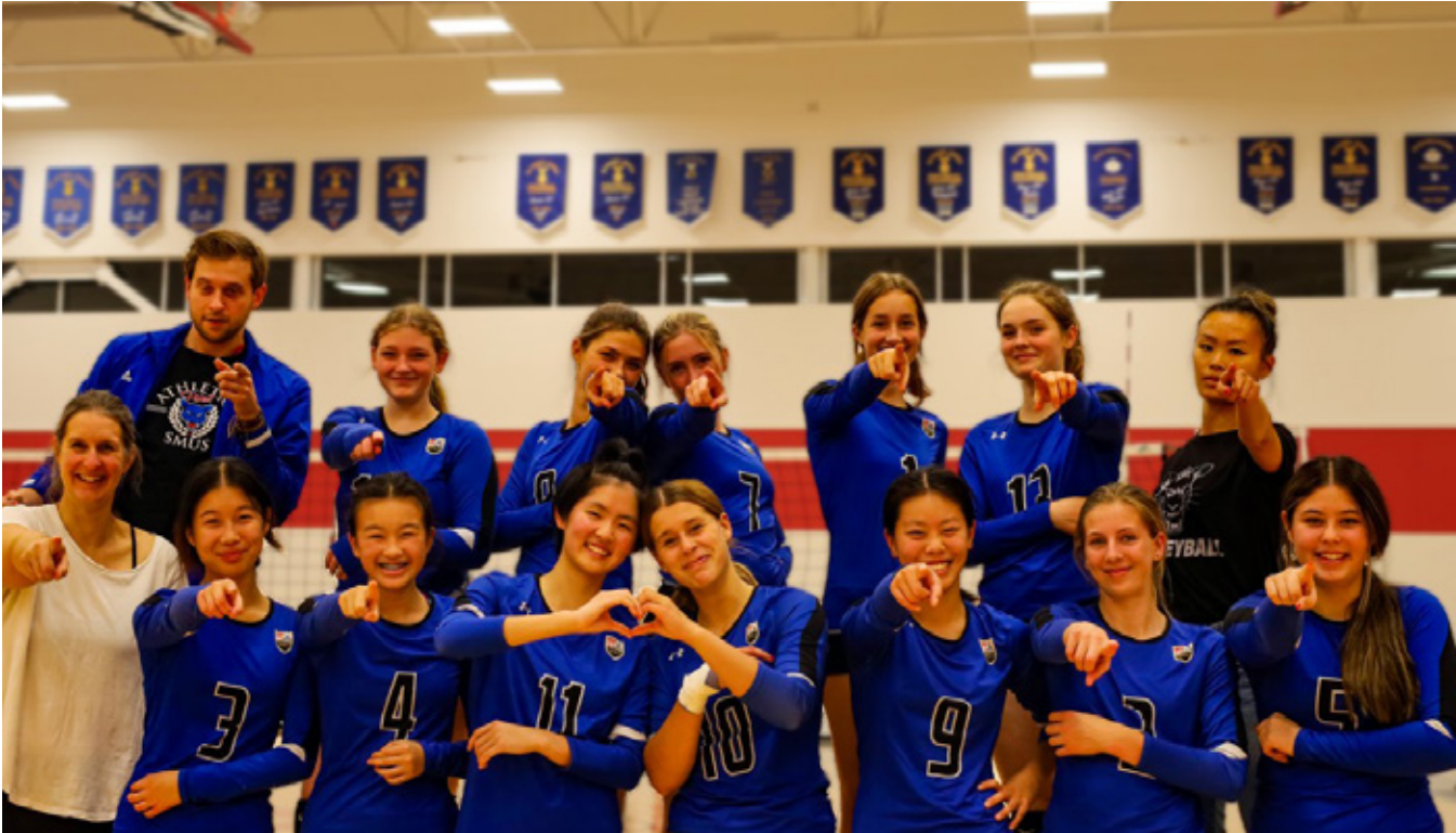
JUNIOR GIRLS VOLLEYBALL TEAM