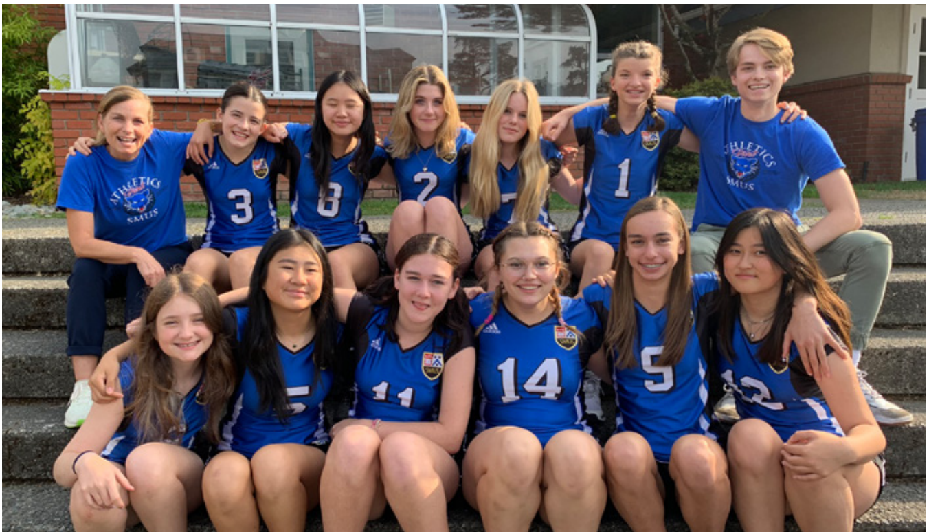
DEVELOPMENT JUNIOR GIRLS VOLLEYBALL TEAM